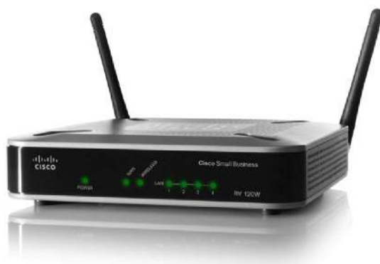
Figure 1. Cisco RV120W Wireless-N VPN Firewall

The Cisco® RV120W Wireless-N VPN Firewall combines highly secure connectivity – to the Internet as well as from other locations and remote workers – with a high-speed, 802.11n wireless access point, a 4-port switch, an intuitive, browser-based device manager, and support for the Cisco FindIT Network Discovery Utility, all at a very affordable price. Its combination of high performance, business-class features and top-quality user experience takes basic connectivity to a new level (Figure 1).