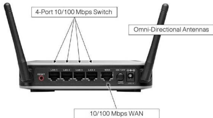
Figure 3. Typical Configuration